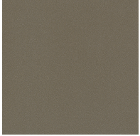
In the Army - 08 (ITA)